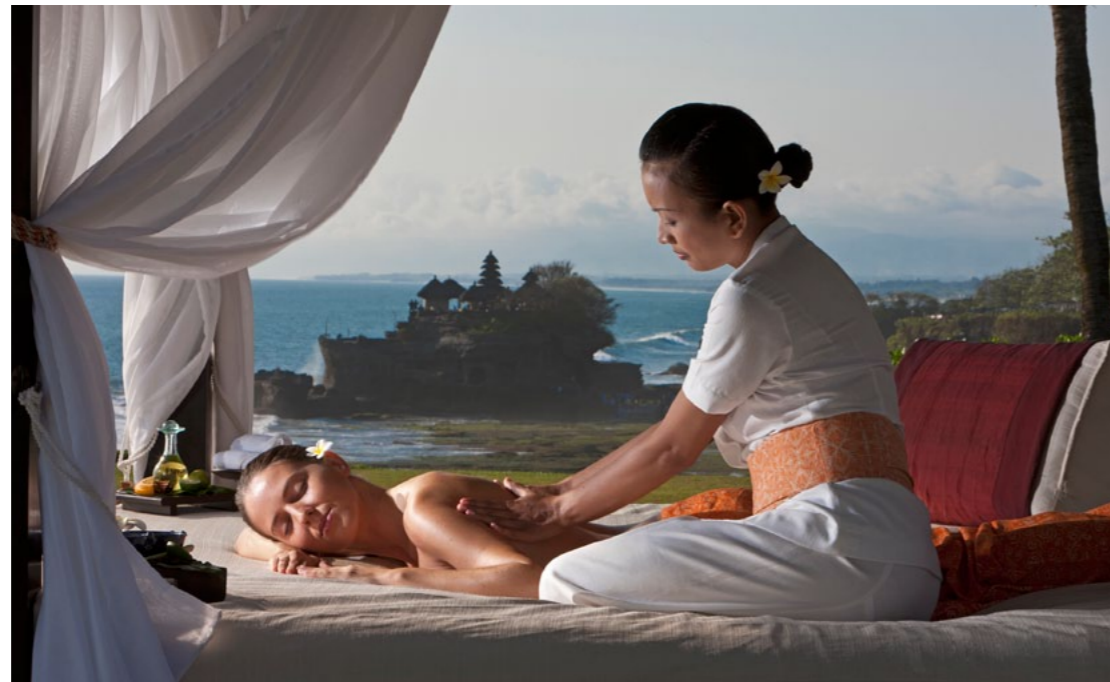
These pages (clockwise from top): 18-hole golf course; Fun in the sun for kids; Relaxing massage with spiritual background.