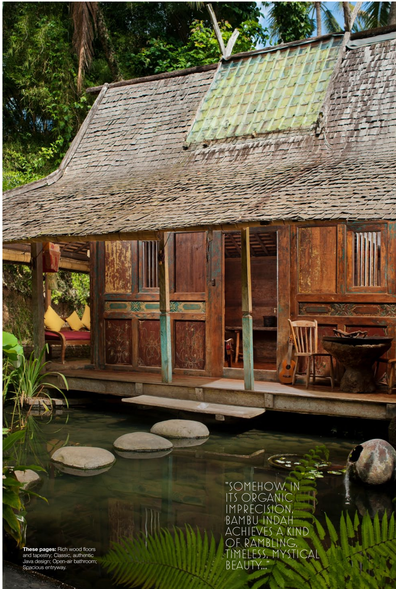
These pages: Rich wood floors and tapestry; Classic, authentic Java design; Open-air bathroom; Spacious entryway.

"SOMEHOW, IN ITS ORGANIC IMPRECISION, BAMBU INDAH ACHIEVES A KIND OF RAMBLING, TIMELESS, MYSTICAL BEAUTY..."