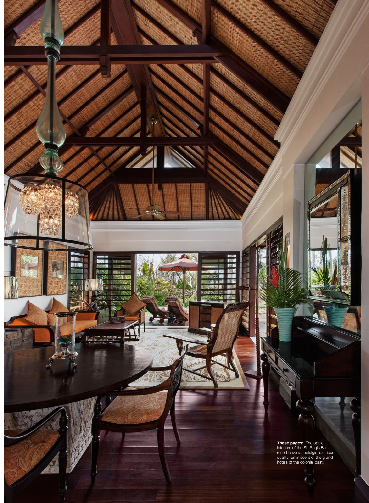
These pages: The opulent interiors of the St. Regis Bali resort have a nostalgic luxurious quality reminiscent of the grand hotels of the colonial past.